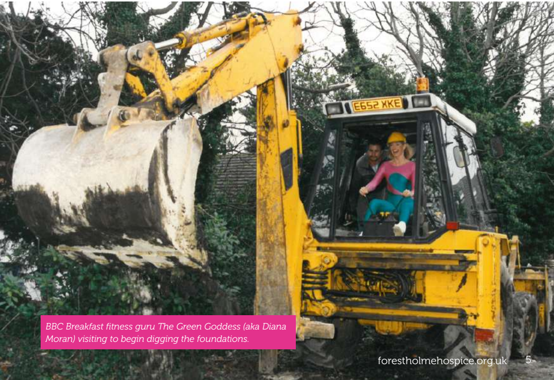
BBC Breakfast fitness guru The Green Goddess (aka Diana Moran) visiting to begin digging the foundations.

There are so many, but what I carry with me is the reputation of Forest Holme in the community, not only in terms of the quality of care but also the enormous support given to the Charity, in all kinds of ways. ”