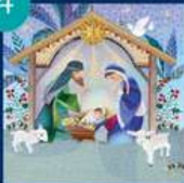
A Child Is Born