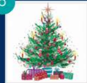
Presents Under The Tree