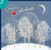
Santa's Christmas Eve