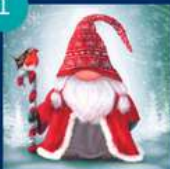
Candy Cane Santa