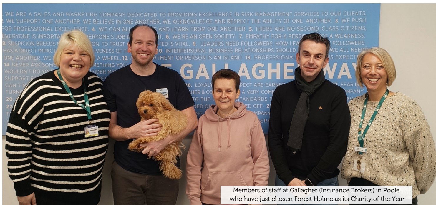
Members of staff at Gallagher (Insurance Brokers) in Poole, who have just chosen Forest Holme as its Charity of the Year