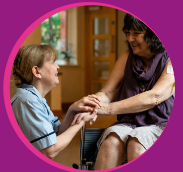
Care on the ward, in hospital and in the community